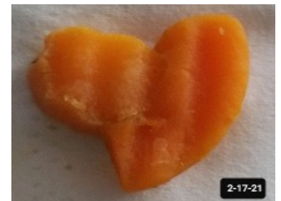
Frozen Carrot 2-17-21