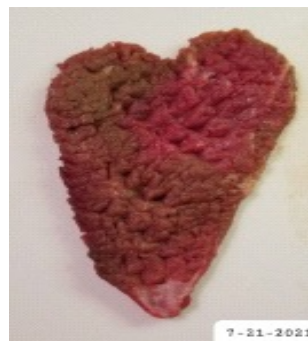
Cube Steak 7-21-2021