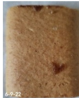
Fig Newton 6-9-22