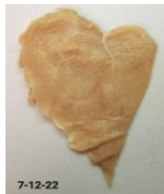
Thawed Chicken 7-12-22