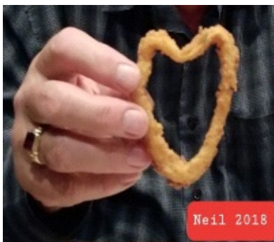
Onion Ring Neil 2018